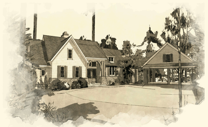
Street Side Elevation

For additional information about Russell Lands neighborhoods, call 256.215.7011 or visit www.RussellLands.com .