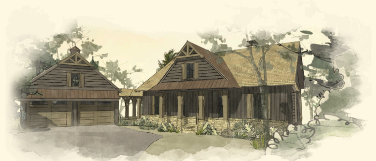
Street Side Elevation

PRICE: Pricing will depend on final features and lot selection.