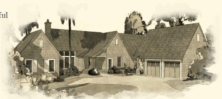
Street Side Elevation

PRICE: Pricing will depend on final features and lot selection.