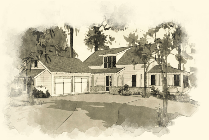
Street Side Elevation

For additional information about Russell Lands neighborhoods, call 256.215.7011 or visit www.RussellLands.com.