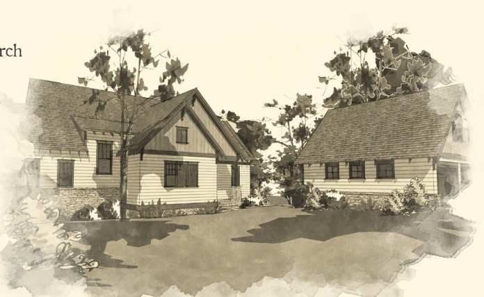
Street Side Elevation

For additional information about Russell Lands neighborhoods, call 256.215.7011 or visit www.RussellLands.com.