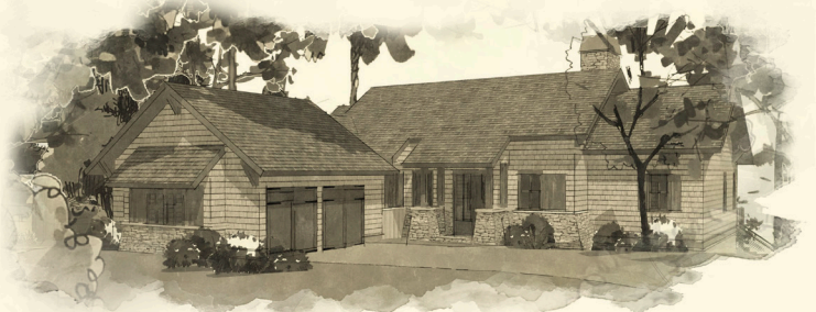
Street Side Elevation

For additional information about Russell Lands neighborhoods, call 256.215.7011 or visit www.RussellLands.com .