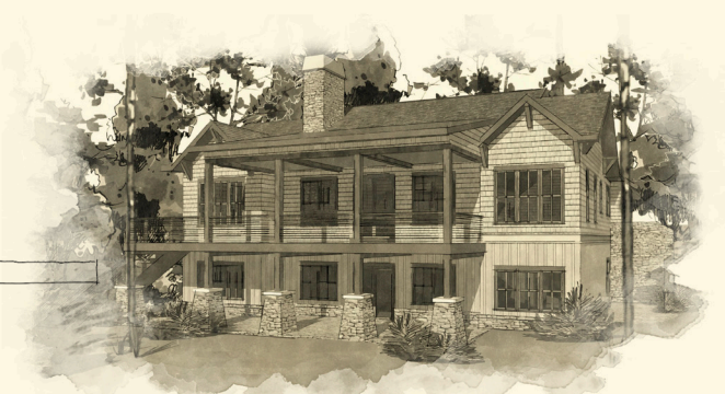
Lake Level HUNTER'S LODGE 1,363 Heated Sq. Ft.