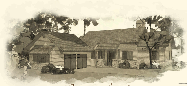
Main Level HUNTER'S LODGE 1,621 Heated Sq. Ft.