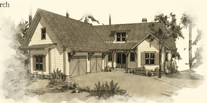
Street Side Elevation

For additional information about Russell Lands neighborhoods, call 256.215.7011 or visit www.RussellLands.com.